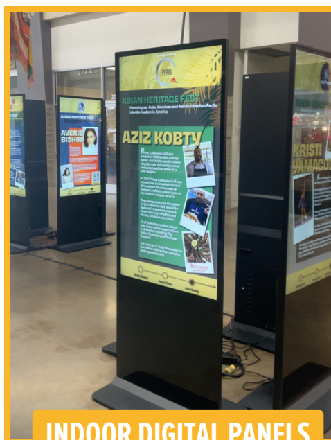
INDOOR DIGITAL PANELS