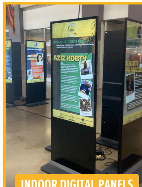
INDOOR DIGITAL PANELS